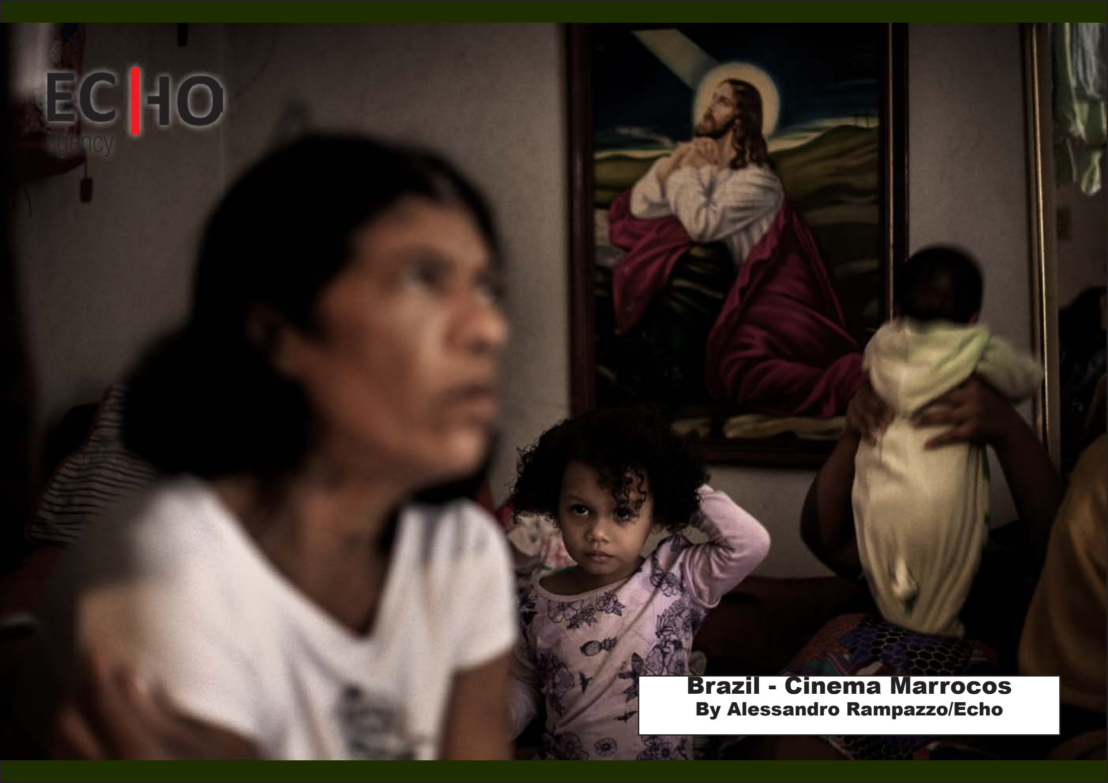
Brazil - Cinema Marrocos