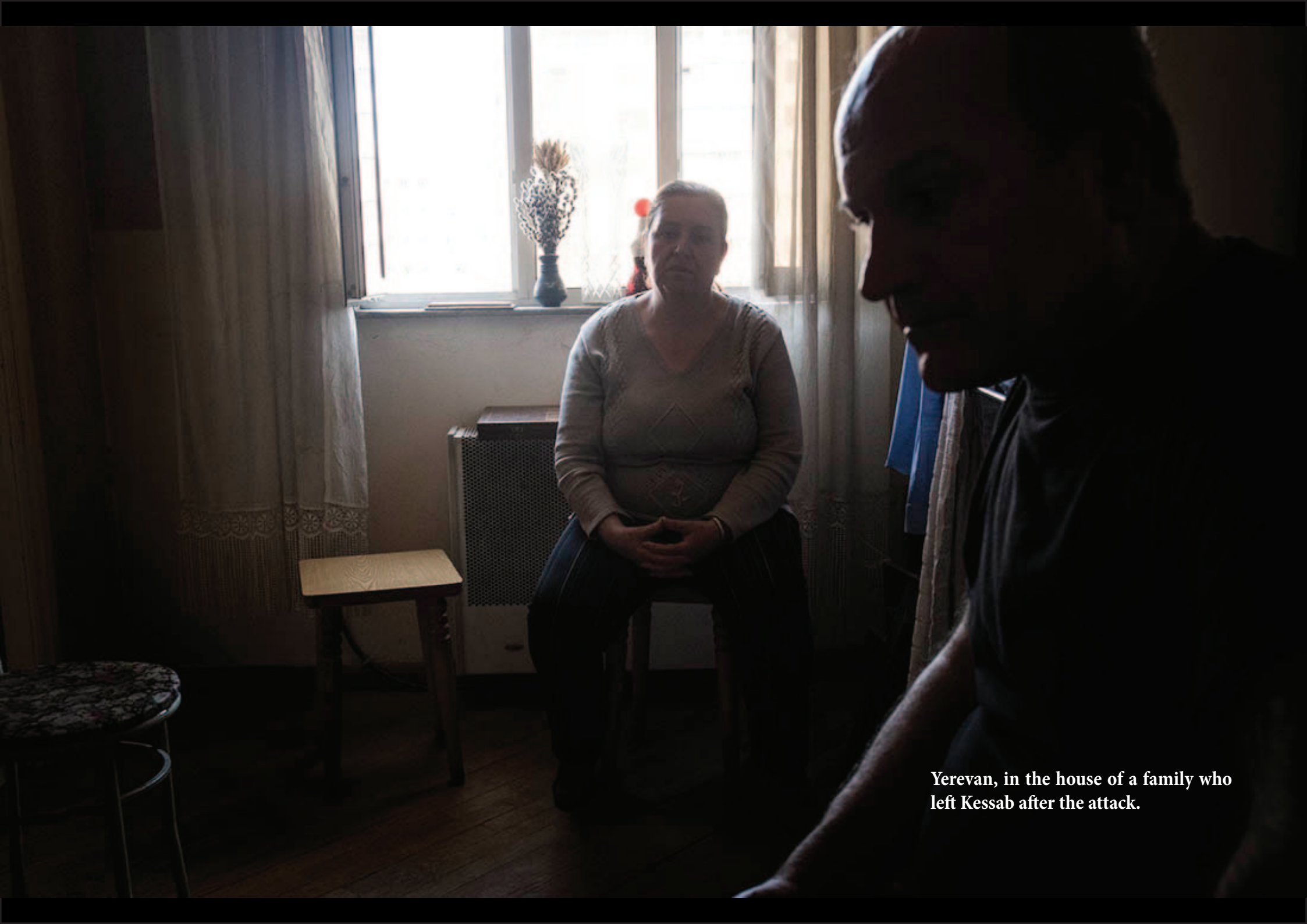
Yerevan, in the house of a family who left Kessab after the attack.